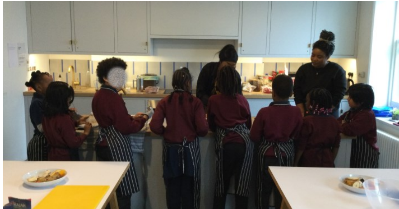
Cooking with the South London Gallery