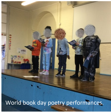
World book day poetry performances.